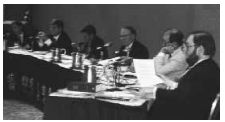
ARIAS•U.S. organizational meeting