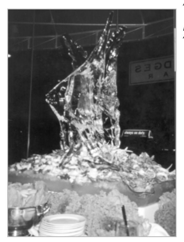
Left: An "Under the Sea" welcome...