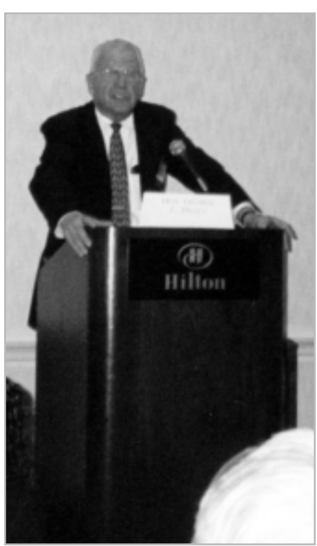
Top Left: Conversations were difficult to end when the breaks were over.

Above Left: Judge Pratt addresses the conference.