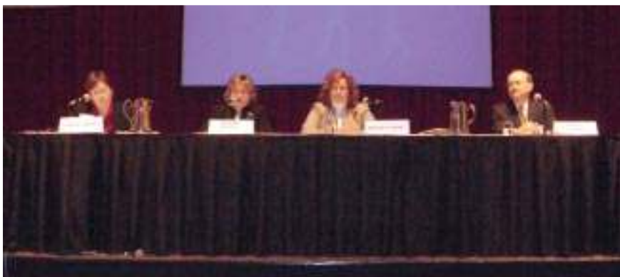
What about mediation?

who could be available to the industry. Training would be the responsibility of the individual through established training programs. ARIAS certified arbitrators who fulfill the requirements would be considered qualified and listed in ARIAS communications. The proposal will be further discussed by the Mediation Committee for possible recommendation to the Board.