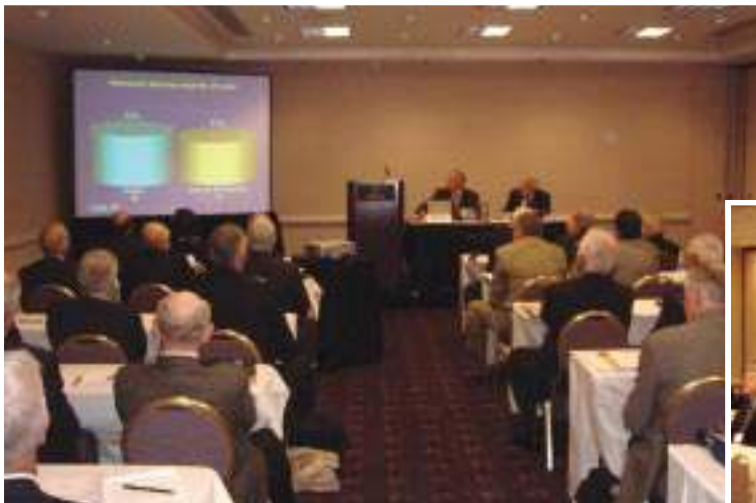
Interactive Workshop A asked attendees for their opinions.