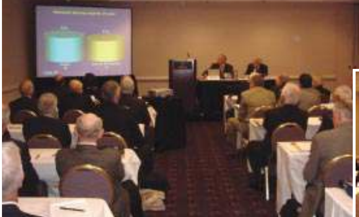
Interactive Workshop A asked attendees for their opinions.

Left: Judge Harold Baer opened the conference.