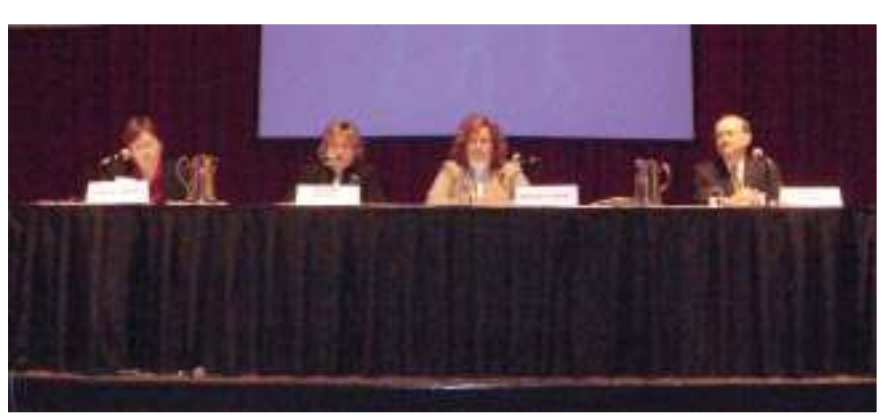
What about mediation?

who could be available to the industry. Training would be the responsibility of the individual through established training programs. ARIAS certified arbitrators who fulfill the requirements would be considered qualified and listed in ARIAS communications. The proposal will be further discussed by the Mediation Committee for possible recommendation to the Board.