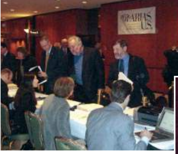
broadly positive. Evaluation sheets indicate that the great majority of attendees were very pleased with the new approach.

Beyond the workshops, the conference opened with an outside point of view and