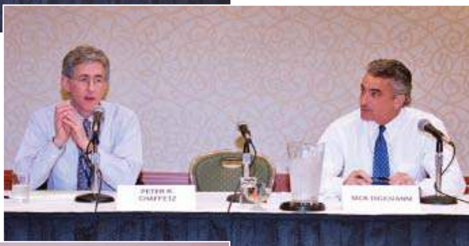
Right: "Electronic Discovery"