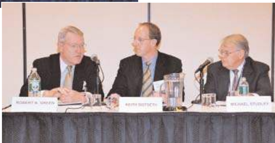
Right: "Confidentiality in Arbitrations"

other types of high-stakes cases that followed.