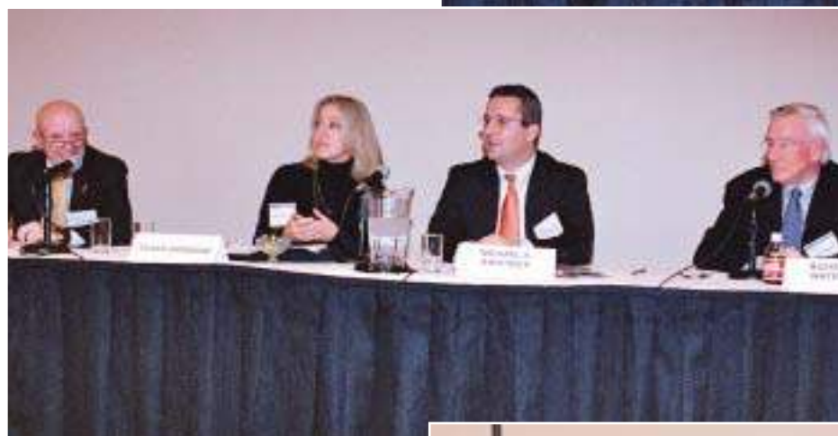
Above: "Mandating Ethics – The Role of ARIAS"