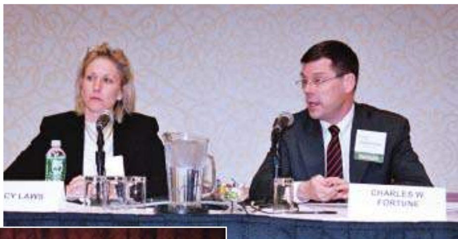
Above: "Legal Terms for Non-Lawyers"