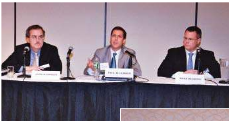
Above: "The Process of Selecting Arbitrators"