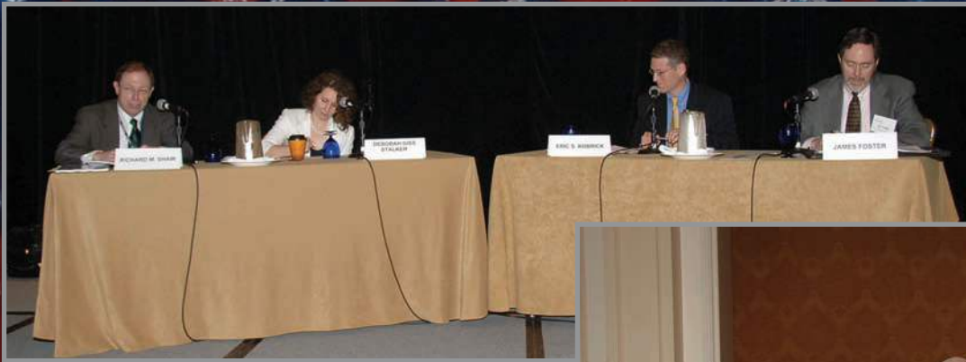
Caucus E - New Contract Clauses and Arbitration Procedures