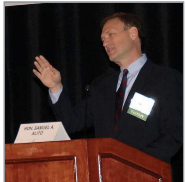
Justice Alito describing recent arbitration cases