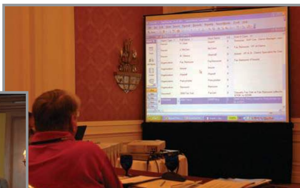
Above: Caucus B - Demonstrating technology