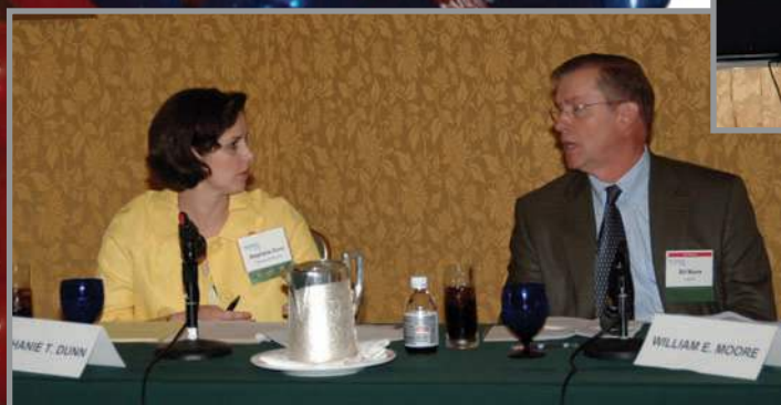
Above: Caucus A - Focusing on life and health reinsurance issues