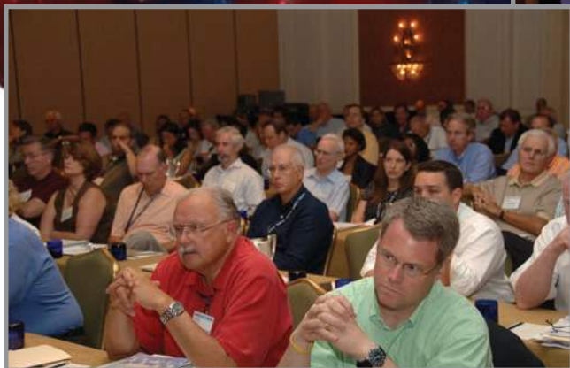
Attendees during Ethics panel

Members are reminded that presentations at the 2008 Spring "Convention" were intended for educational purposes and may not reflect the views or positions of the presenters, the presenters' employers or clients, or the views of ARIAS-U.S. or any specific members of ARIAS.