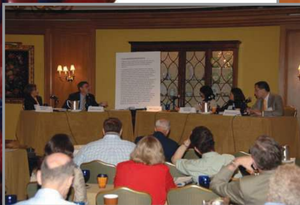
Left: Caucus C - Newer Arbitrator Program Mock Streamlined Arbitration