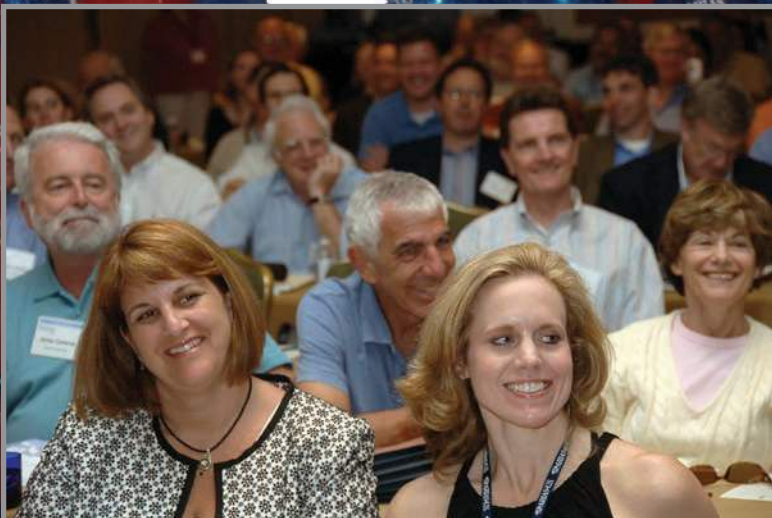
Attendees during Alito keynote

After that session, five simultaneous workshops took place and were repeated after the morning break, so that each attendee was able to attend two. All "caucuses" were well attended, with New Contract Clauses garnering somewhat more than the others. The featured topics were as follows: