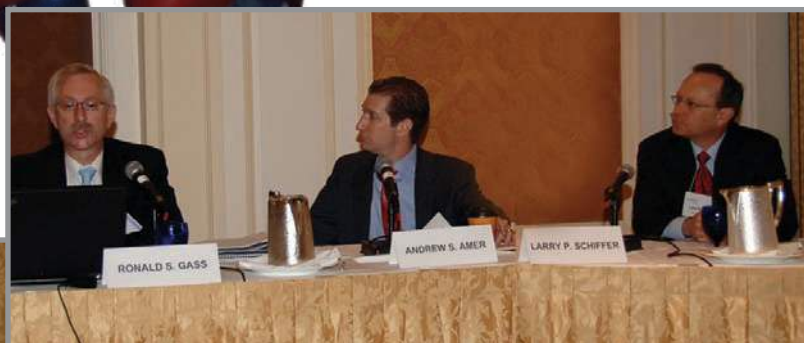
Caucus B - Managing arbitrations with technology