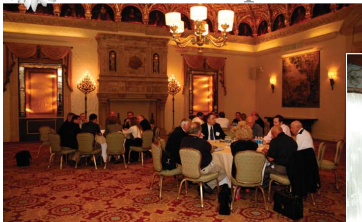
Twenty-six groups gathered around 26 tables to exchange thoughts on the issues in "Scenes from a Hearing Room."