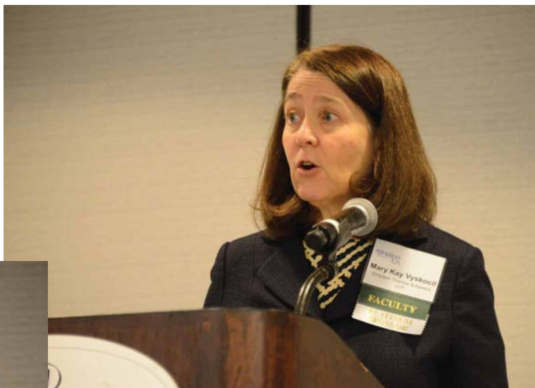
Mary Kay Vyskocil Nominates