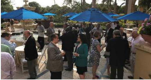
Cocktail Reception and Networking