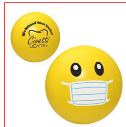
Stress ball with face mask