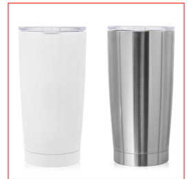
Coffee Mugs or Tumblers