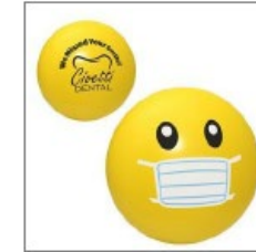
Stress ball with face mask