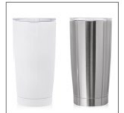
Coffee Mugs or Tumblers